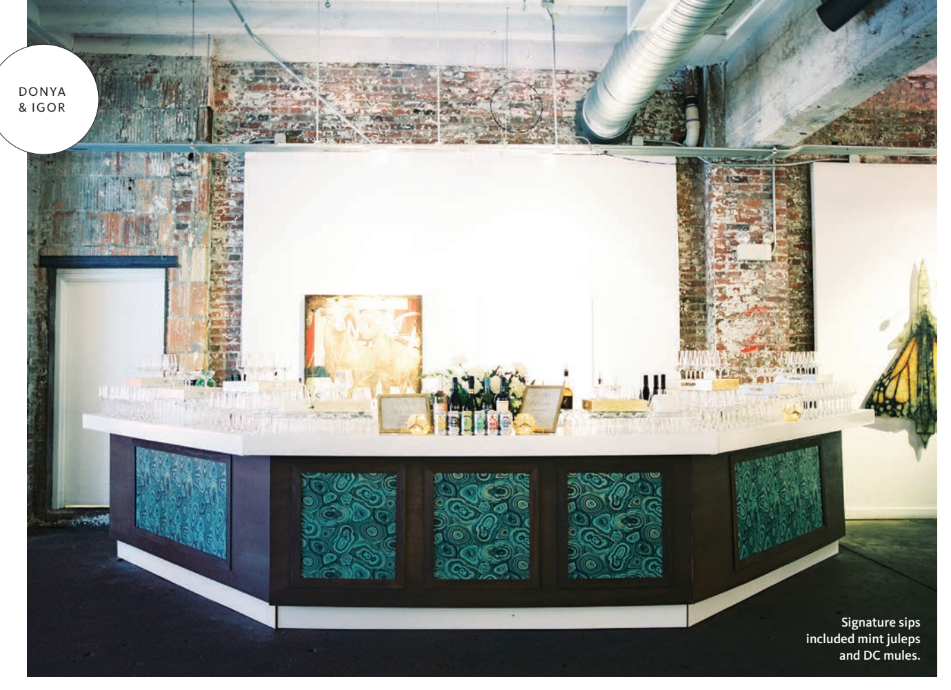
"We wanted a simple, elegant wedding where it was easy to eat and to talk with your tablemates," Donya says. Wood tables featured low arrangements of greenery, geometric terrariums, candles, white napkins and gold flatware. Anthopologie's malachite-inspired wallpaper decorated the bar and the stage for the musicians.