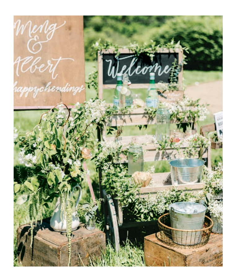
THE WELCOME STATION (ABOVE) INCLUDED WILD BERRY-BASIL AND CITRUS-RASPBERRY INFUSED WATERS. BEFORE EXCHANGING VOWS UNDER A BIRCH-WOOD ARBOR (RIGHT), THE COUPLE PRESENTED THEIR MOTHERS WITH ROSES IN A CEREMONY OF GRATITUDE.